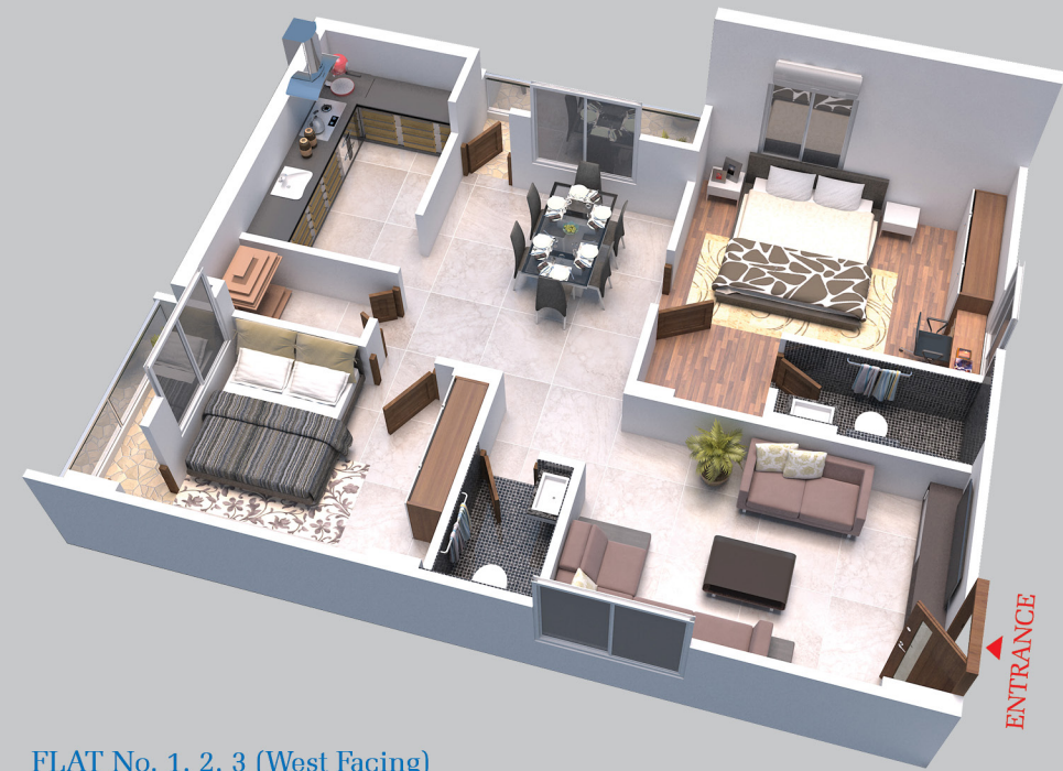
FLAT No. 1, 2, 3 (West Facing) 2 BHK 3D VIEW