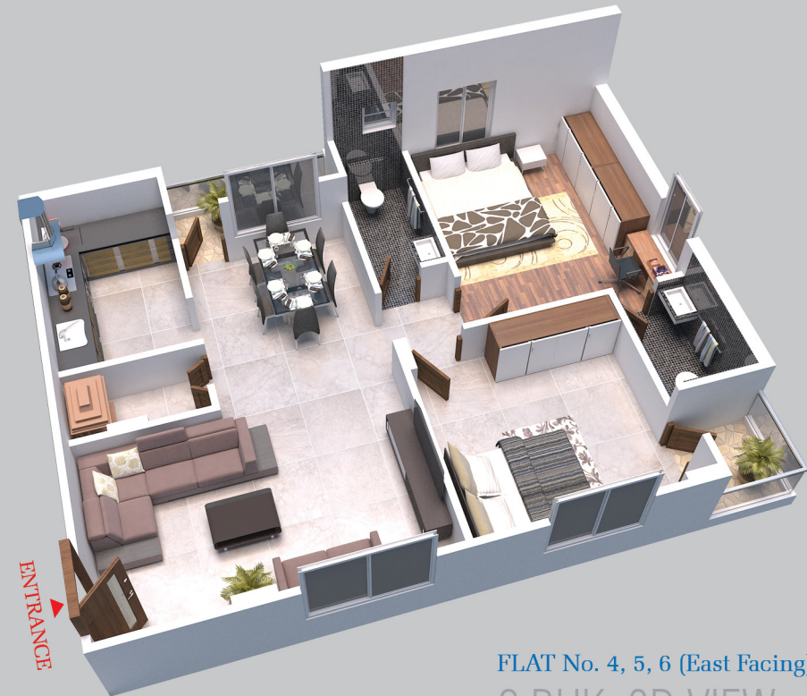
FLAT No. 4, 5, 6 (East Facing) 2 BHK 3D VIEW